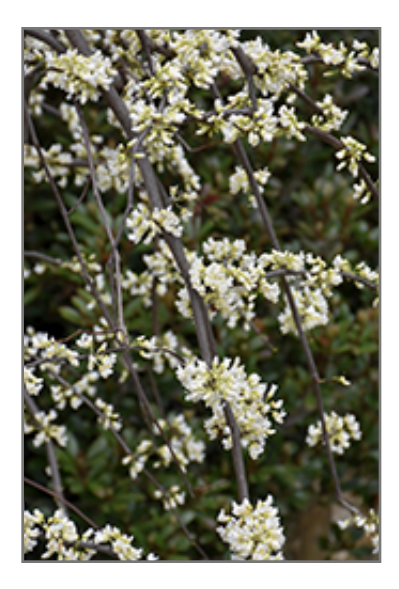
Vanilla Twist Weeping Redbud flowers