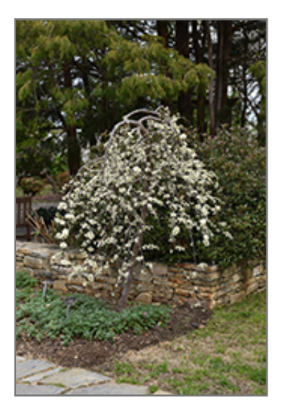
Vanilla Twist Weeping Redbud in bloom

Vanilla Twist Weeping Redbud is recommended for the following landscape applications;