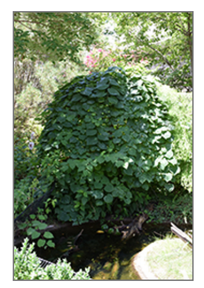
Vanilla Twist Weeping Redbud

This shrub does best in full sun to partial shade. It prefers to grow in average to moist conditions, and shouldn't be allowed to dry out. It is not particular as to soil type or pH. It is highly tolerant of urban pollution and will even thrive in inner city environments, and will benefit from being planted in a relatively sheltered location. Consider applying a thick mulch around the root zone in winter to protect it in exposed locations or colder microclimates. This is a selection of a native North American species.