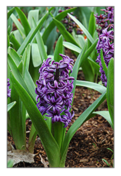
Atlantic Hyacinth flowers

Highly fragrant and eye catching, this variety features sturdy stems, densely packed with star-shaped, indigo-violet colored blooms during the early to mid spring months; a lovely addition to beds, borders and containers; excellent cut flower quality