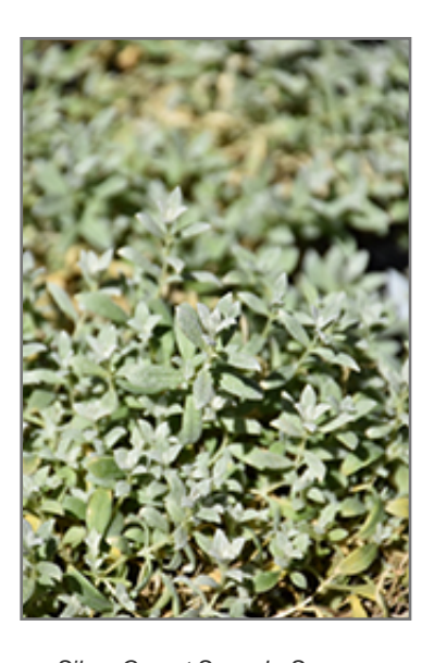
Silver Carpet Snow-In-Summer foliage

This plant should only be grown in full sunlight. It prefers dry to average moisture levels with very well-drained soil, and will often die in standing water. It is considered to be drought-tolerant, and thus makes an ideal choice for a low-water garden or xeriscape application. It is not particular as to soil type or pH. It is highly tolerant of urban pollution and will even thrive in inner city environments. This is a selected variety of a species not originally from North America. It can be propagated by division; however, as a cultivated variety, be aware that it may be subject to certain restrictions or prohibitions on propagation.