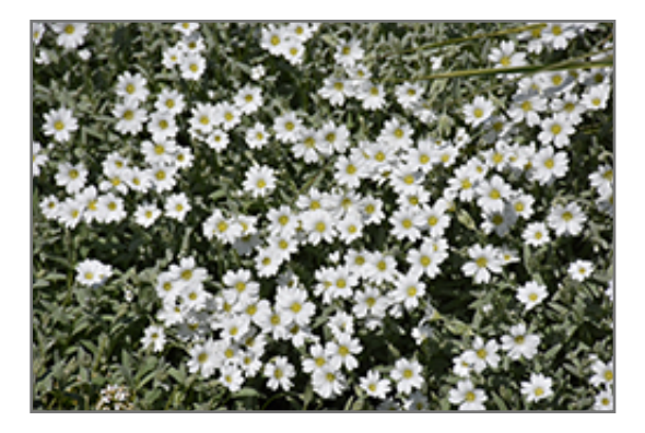
Silver Carpet Snow-In-Summer flowers