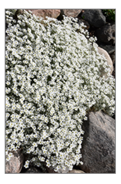
Silver Carpet Snow-In-Summer in hloom