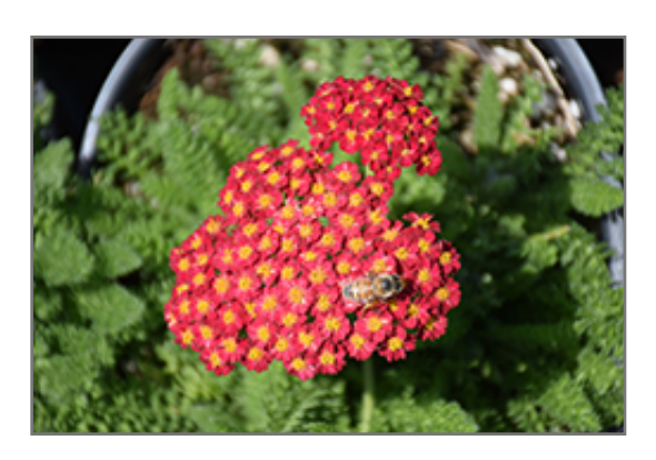
Desert Eve Red Yarrow flowers

Large, brick red flower clusters above a compact growth habit will add interesting texture and color; excellent for xeriscaping and hot, sunny, dry locations in the garden; performs well on hot sites