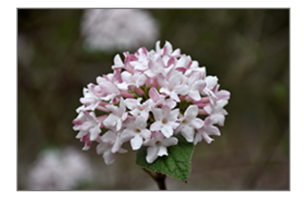
Spice Baby Koreanspice Viburnum flowers