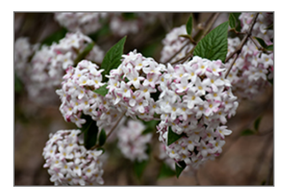
Spice Baby Koreanspice Viburnum flowers

Spice Baby Koreanspice Viburnum is a dense multi-stemmed deciduous shrub with an upright spreading habit of growth. Its average texture blends into the landscape, but can be balanced by one or two finer or coarser trees or shrubs for an effective composition.