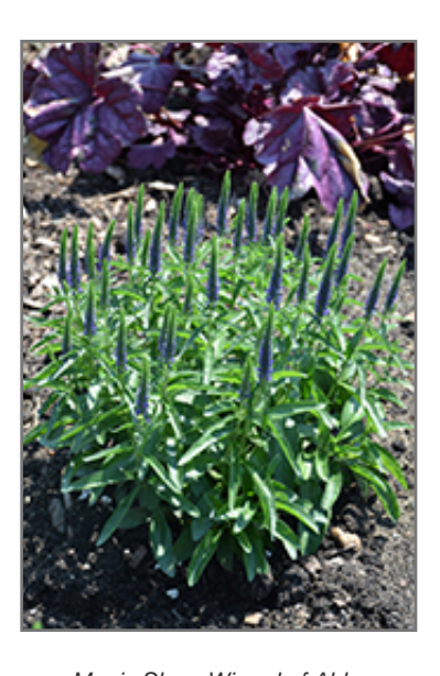
Magic Show Wizard of Ahhs Speedwell in bloom

This plant does best in full sun to partial shade. It does best in average to evenly moist conditions, but will not tolerate standing water. It is not particular as to soil pH, but grows best in sandy soils, and is able to handle environmental salt. It is highly tolerant of urban pollution and will even thrive in inner city environments. This particular variety is an interspecific hybrid. It can be propagated by division; however, as a cultivated variety, be aware that it may be subject to certain restrictions or prohibitions on propagation.