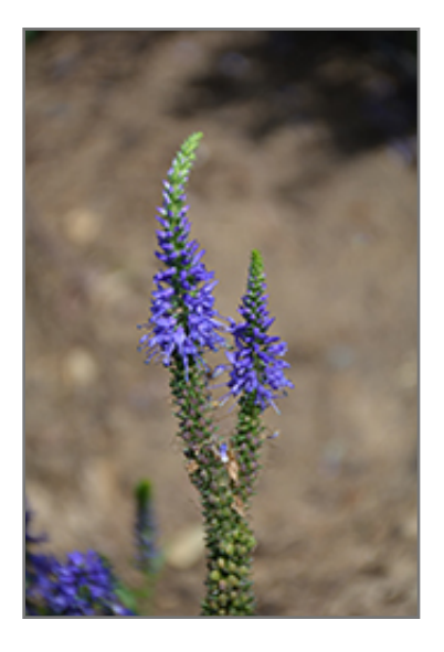
Magic Show Wizard of Ahhs Speedwell flowers