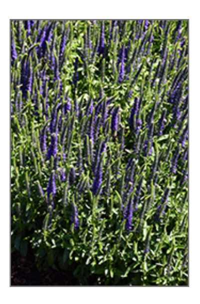
Magic Show Wizard of Ahhs Speedwell in bloom

Magic Show Wizard of Ahhs Speedwell is recommended for the following landscape applications;