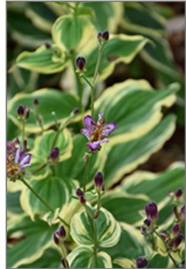
Samurai Toad Lily flowers

Samurai Toad Lily is recommended for the following landscape applications;