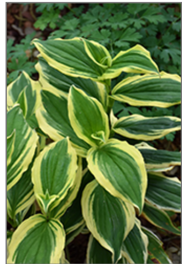
Samurai Toad Lily foliage