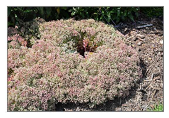
Steel The Show Stonecrop in bloom