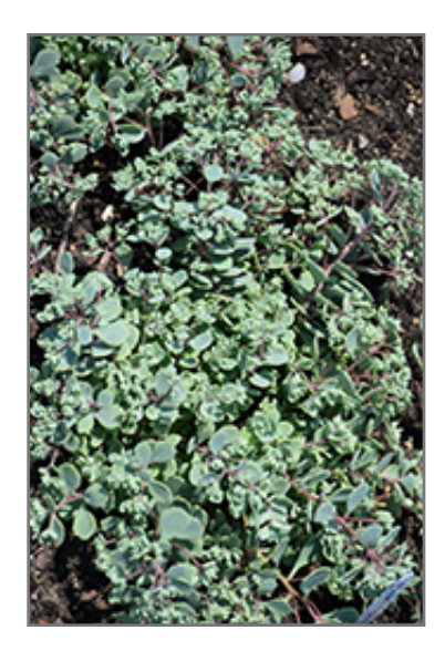
Steel The Show Stonecrop foliage

Steel The Show Stonecrop is a dense herbaceous perennial with an upright spreading habit of growth. Its medium texture blends into the garden, but can always be balanced by a couple of finer or coarser plants for an effective composition.