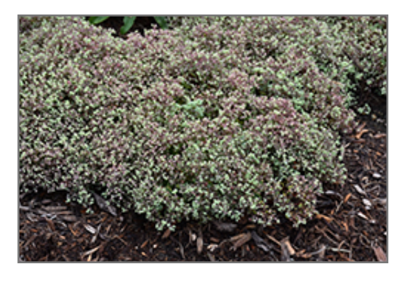
Steel The Show Stonecrop in bloom

Steel The Show Stonecrop will grow to be only 6 inches tall at maturity, with a spread of 16 inches. When grown in masses or used as a bedding plant, individual plants should be spaced approximately 14 inches apart. Its foliage tends to remain low and dense right to the ground. It grows at a fast rate, and under ideal conditions can be expected to live for approximately 15 years. As an herbaceous perennial, this plant will usually die back to the crown each winter, and will regrow from the base each spring. Be careful not to disturb the crown in late winter when it may not be readily seen!