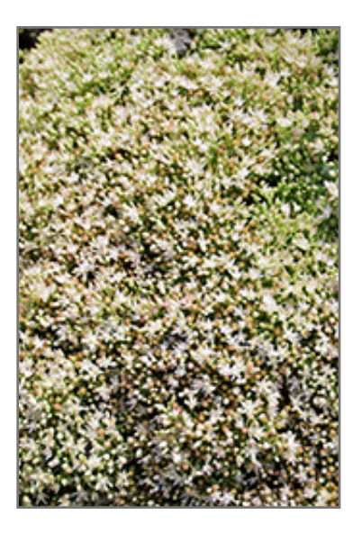
Rock 'N Round Bundle Of Joy Stonecrop flowers

Rock 'N Round Bundle Of Joy Stonecrop is a fine choice for the garden, but it is also a good selection for planting in outdoor pots and containers. It is often used as a 'filler' in the 'spiller-thriller-filler' container combination, providing a mass of flowers and foliage against which the thriller plants stand out. Note that when growing plants in outdoor containers and baskets, they may require more frequent waterings than they would in the yard or garden. Be aware that in our climate, most plants cannot be expected to survive the winter if left in containers outdoors, and this plant is no exception. Contact our experts for more information on how to protect it over the winter months.