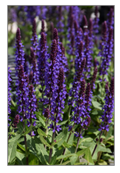
Violet Profusion Meadow Sage flowers

Violet Profusion Meadow Sage is recommended for the following landscape applications;