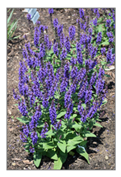
Violet Profusion Meadow Sage in bloom