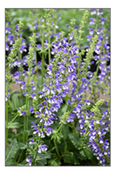
Color Spires Azure Snow Sage flowers

Color Spires Azure Snow Sage is recommended for the following landscape applications;