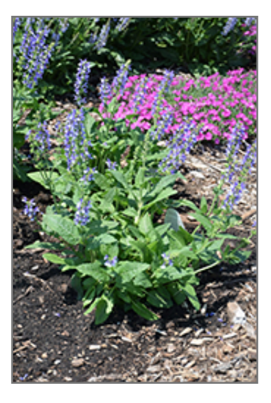
Color Spires Azure Snow Sage in Photo courtesy of NetPS Plant Finder