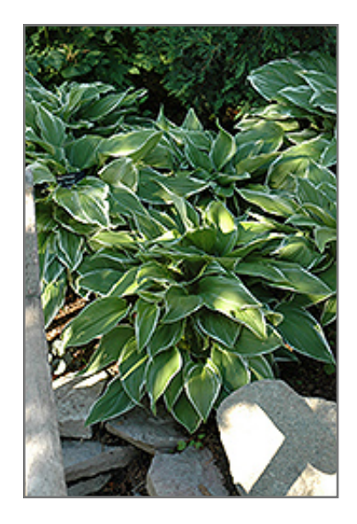
Mountain Snow Hosta