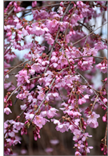
Pink Cascade Weeping Cherry flowers

Pink Cascade Weeping Cherry is recommended for the following landscape applications;