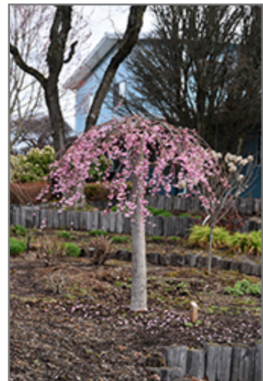
Pink Cascade Weeping Cherry in bloom