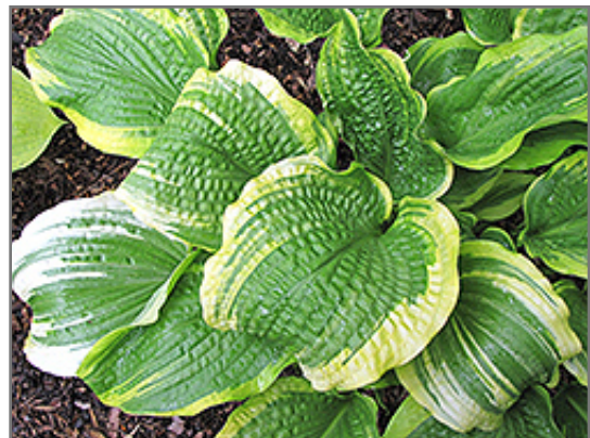
Gold-Variegated Mountain Hosta foliage