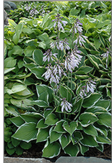
Gold-Variegated Mountain Hosta in bloom

This plant does best in partial shade to shade. It prefers to grow in average to moist conditions, and shouldn't be allowed to dry out. It is not particular as to soil type or pH. It is somewhat tolerant of urban pollution. This is a selected variety of a species not originally from North America. It can be propagated by division; however, as a cultivated variety, be aware that it may be subject to certain restrictions or prohibitions on propagation.