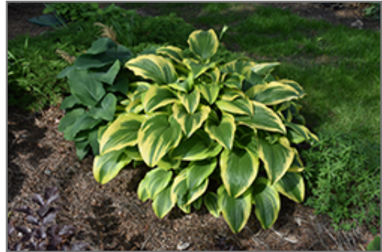
Gold-Variegated Mountain Hosta