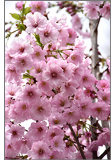
First Blush Flowering Cherry flowers