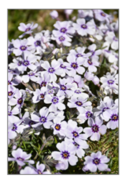
North Hills Moss Phlox flowers

This variety produces a showy display of bright white flowers with violet-purple eyes; prune lightly after flowering to encourage a dense growth habit; wonderful for rock gardens, edging, or in mixed containers