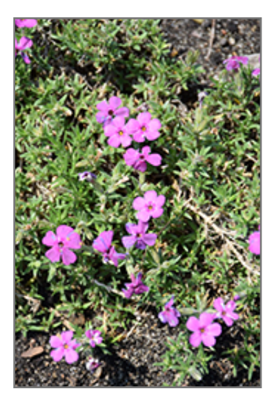
Rocky Road Magenta Phlox flowers

Rocky Road Magenta Phlox is recommended for the following landscape applications;