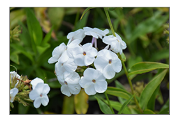
Opening Act White Phlox flowers

Opening Act White Phlox is recommended for the following landscape applications;