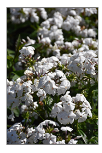
Opening Act White Phlox flowers

This plant will require occasional maintenance and upkeep, and should not require much pruning, except when necessary, such as to remove dieback. It is a good choice for attracting butterflies and hummingbirds to your yard, but is not particularly attractive to deer who tend to leave it alone in favor of tastier treats. It has no significant negative characteristics.