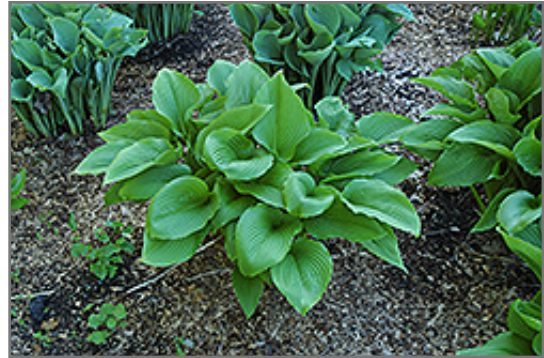
Mountain Hosta