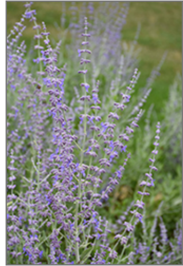
Blue Steel Russian Sage flowers

This plant should only be grown in full sunlight. It prefers dry to average moisture levels with very well-drained soil, and will often die in standing water. It is considered to be drought-tolerant, and thus makes an ideal choice for a low-water garden or xeriscape application. It is not particular as to soil type, but has a definite preference for alkaline soils. It is highly tolerant of urban pollution and will even thrive in inner city environments. This is a selected variety of a species not originally from North America.