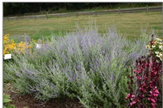
Blue Steel Russian Sage in bloom