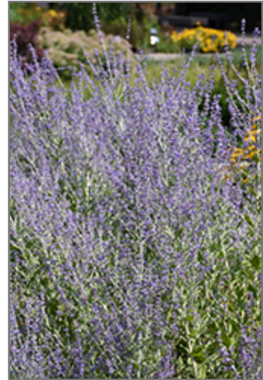
Blue Steel Russian Sage flowers

This is a relatively low maintenance plant, and is best cut back to the ground in late winter before active growth resumes. It is a good choice for attracting butterflies and hummingbirds to your yard, but is not particularly attractive to deer who tend to leave it alone in favor of tastier treats. It has no significant negative characteristics.