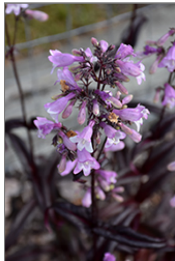
Midnight Masquerade Beard Tongue flowers

Midnight Masquerade Beard Tongue is recommended for the following landscape applications;