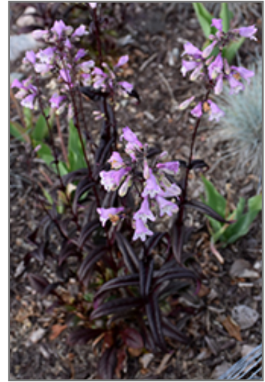
Midnight Masquerade Beard Tongue in bloom

Midnight Masquerade Beard Tongue is a fine choice for the garden, but it is also a good selection for planting in outdoor pots and containers. With its upright habit of growth, it is best suited for use as a 'thriller' in the 'spiller-thriller-filler' container combination; plant it near the center of the pot, surrounded by smaller plants and those that spill over the edges. It is even sizeable enough that it can be grown alone in a suitable container. Note that when growing plants in outdoor containers and baskets, they may require more frequent waterings than they would in the yard or garden. Be aware that in our climate, most plants cannot be expected to survive the winter if left in containers outdoors, and this plant is no exception. Contact our experts for more information on how to protect it over the winter months.