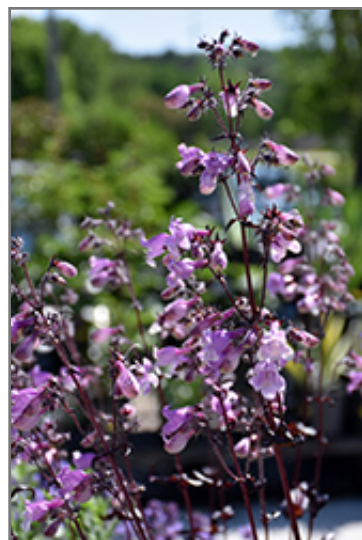
Midnight Masquerade Beard Tongue flowers