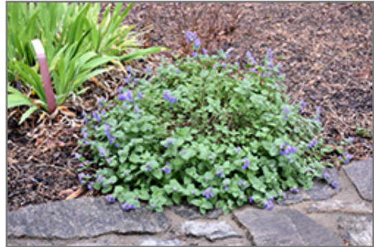
Early Bird Catmint in bloom

Early Bird Catmint is a fine choice for the garden, but it is also a good selection for planting in outdoor pots and containers. It is often used as a 'filler' in the 'spiller-thriller-filler' container combination, providing a mass of flowers against which the thriller plants stand out. Note that when growing plants in outdoor containers and baskets, they may require more frequent waterings than they would in the yard or garden. Be aware that in our climate, most plants cannot be expected to survive the winter if left in containers outdoors, and this plant is no exception. Contact our experts for more information on how to protect it over the winter months.