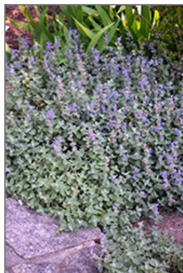
Early Bird Catmint in bloom