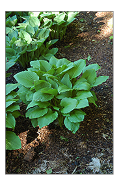
Erromena Hosta

Lovely mounds of textured, green, long and narrow foliage create the perfect background for shaded borders and gardens; lavender flowers appear on arching scapes during the mid summer; adds texture and contrast; low maintenance and easy to grow