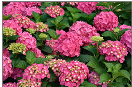
Summer Crush Hydrangea flowers