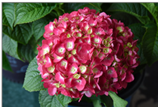
Summer Crush Hydrangea flowers