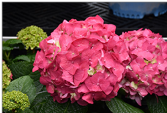
Summer Crush Hydrangea flowers