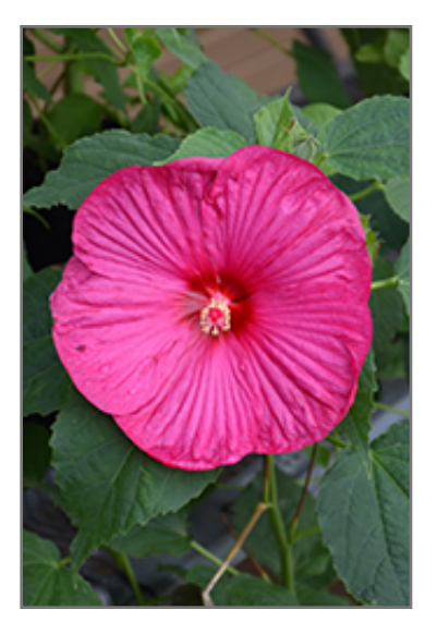
Luna Rose Hibiscus flowers

A very compact version of this perennial featuring showy ruffled, dinner-plate, rose flowers with creamy stamens; attractive medium green leaves; ideal for the mixed garden border or in mass; do not allow to dry to wilting point