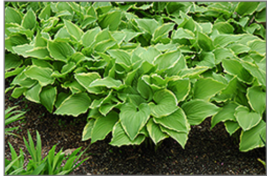
Summer Fragrance Hosta