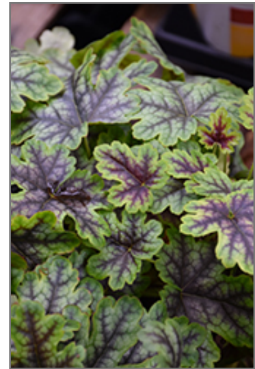
Tapestry Foamy Bells foliage

Tapestry Foamy Bells is recommended for the following landscape applications;