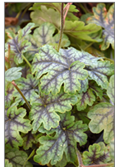
Tapestry Foamy Bells foliage