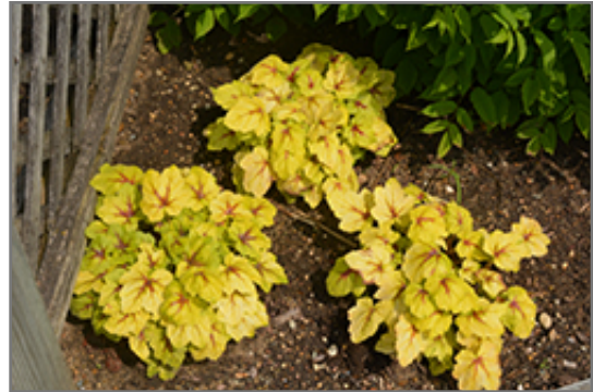
Catching Fire Foamy Bells