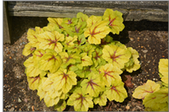
Catching Fire Foamy Bells

Catching Fire Foamy Bells is a dense herbaceous evergreen perennial with tall flower stalks held atop a low mound of foliage. Its medium texture blends into the garden, but can always be balanced by a couple of finer or coarser plants for an effective composition.