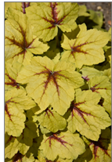
Catching Fire Foamy Bells foliage