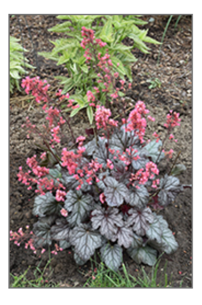
Timeless Treasure Coral Bells in hloom

Timeless Treasure Coral Bells is recommended for the following landscape applications;