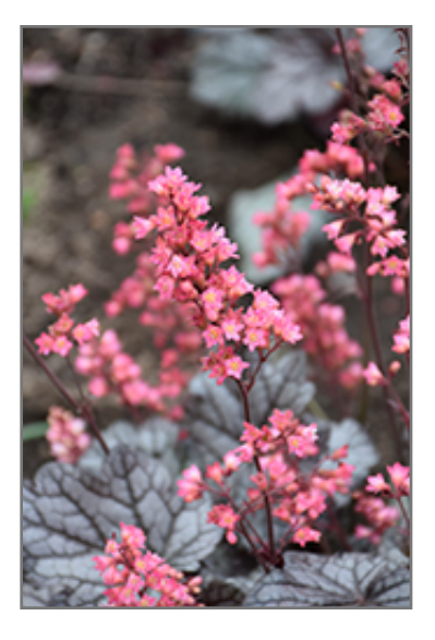
Timeless Treasure Coral Bells