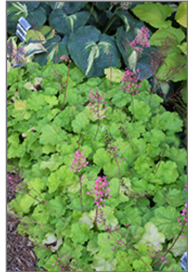
Primo Pretty Pistachio Coral Bells in bloom

This is a relatively low maintenance plant, and should be cut back in late fall in preparation for winter. It is a good choice for attracting butterflies and hummingbirds to your yard. It has no significant negative characteristics.