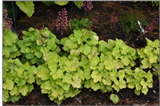
Primo Pretty Pistachio Coral Bells

Primo Pretty Pistachio Coral Bells is a fine choice for the garden, but it is also a good selection for planting in outdoor pots and containers. With its upright habit of growth, it is best suited for use as a 'thriller' in the 'spiller-thriller-filler' container combination; plant it near the center of the pot, surrounded by smaller plants and those that spill over the edges. Note that when growing plants in outdoor containers and baskets, they may require more frequent waterings than they would in the yard or garden. Be aware that in our climate, most plants cannot be expected to survive the winter if left in containers outdoors, and this plant is no exception. Contact our experts for more information on how to protect it over the winter months.