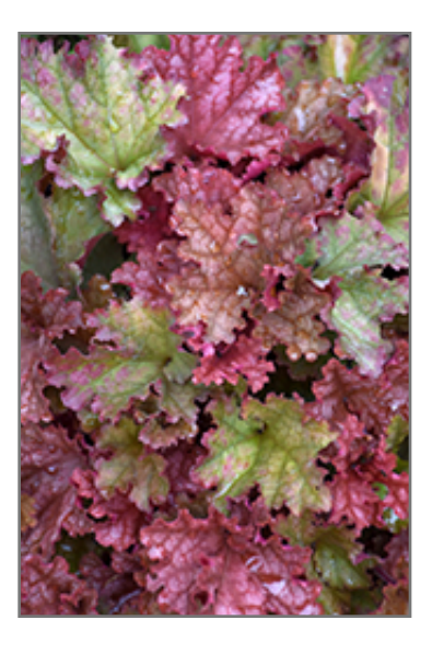
Peachberry Ice Coral Bells flowers

This is a relatively low maintenance plant, and should be cut back in late fall in preparation for winter. It is a good choice for attracting hummingbirds to your yard. It has no significant negative characteristics.