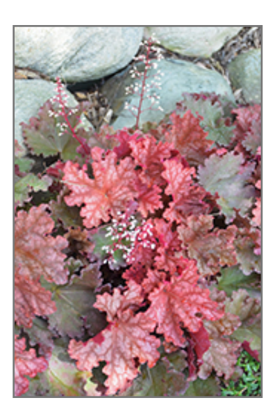
Peachberry Ice Coral Bells foliage