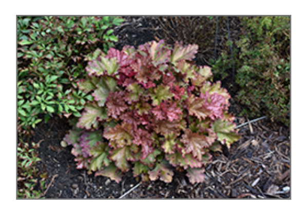
Peachberry Ice Coral Bells

Peachberry Ice Coral Bells will grow to be about 10 inches tall at maturity extending to 24 inches tall with the flowers, with a spread of 32 inches. When grown in masses or used as a bedding plant, individual plants should be spaced approximately 30 inches apart. Its foliage tends to remain low and dense right to the ground. It grows at a medium rate, and under ideal conditions can be expected to live for approximately 10 years. As an evegreen perennial, this plant will typically keep its form and foliage year-round.