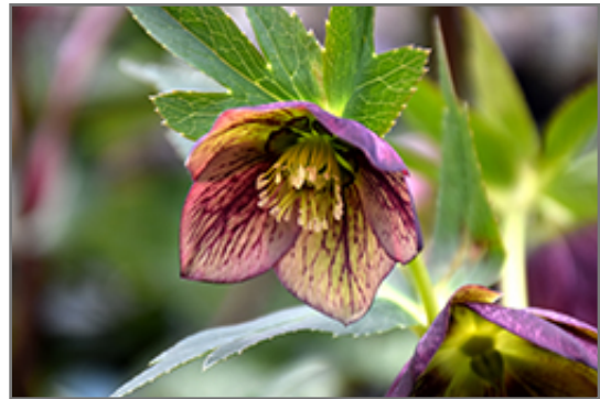
Winter Jewels Jade Star Hellebore flowers

Winter Jewels Jade Star Hellebore is recommended for the following landscape applications;