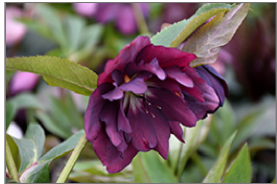
Wedding Party Dashing Groomsmen Hellebore flowers

Wedding Party Dashing Groomsmen Hellebore is recommended for the following landscape applications;