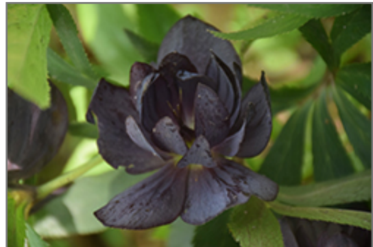
Wedding Party Dark and Handsome Hellebore flowers (faded)

Wedding Party Dark and Handsome Hellebore is recommended for the following landscape applications;