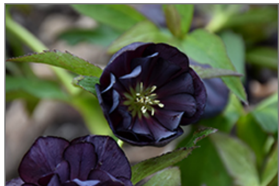
Wedding Party Dark and Handsome Hellebore flowers