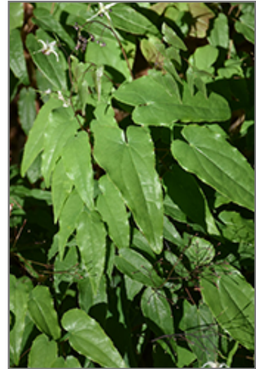
Domino Barrenwort foliage

Domino Barrenwort is a fine choice for the garden, but it is also a good selection for planting in outdoor pots and containers. Because of its spreading habit of growth, it is ideally suited for use as a 'spiller' in the 'spiller-thriller-filler' container combination; plant it near the edges where it can spill gracefully over the pot. It is even sizeable enough that it can be grown alone in a suitable container. Note that when growing plants in outdoor containers and baskets, they may require more frequent waterings than they would in the yard or garden. Be aware that in our climate, most plants cannot be expected to survive the winter if left in containers outdoors, and this plant is no exception. Contact our experts for more information on how to protect it over the winter months.