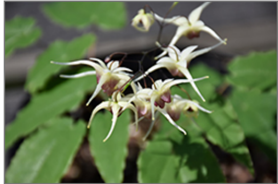
Domino Barrenwort flowers

Domino Barrenwort is a dense herbaceous evergreen perennial with a ground-hugging habit of growth. Its relatively fine texture sets it apart from other garden plants with less refined foliage.