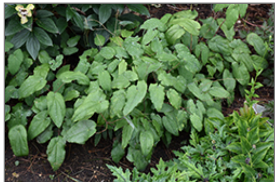
Domino Barrenwort