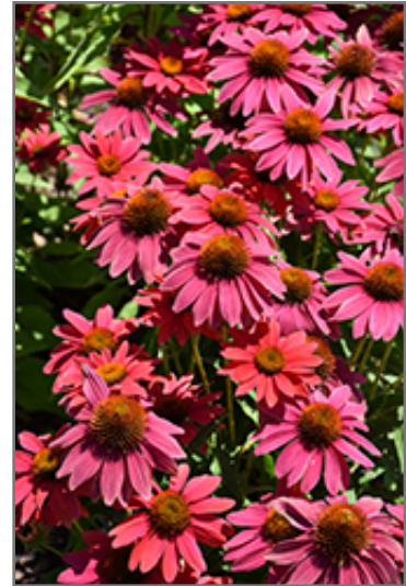
Sombrero Tres Amigos Coneflower flowers

Sombrero Tres Amigos Coneflower is an herbaceous perennial with an upright spreading habit of growth. Its medium texture blends into the garden, but can always be balanced by a couple of finer or coarser plants for an effective composition.