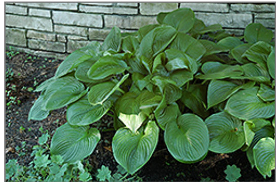
Satin Beauty Hosta

Satin Beauty Hosta is recommended for the following landscape applications;