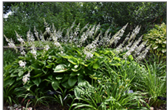
Satin Beauty Hosta in bloom