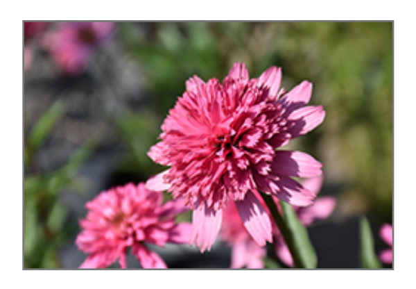
Cone-fections Mini Belle Coneflower flowers

This stunning, compact echinacea produces attractive rose-pink double flowers; a perfect choice for planting in smaller garden areas, along border edges, or in containers; great for flower arrangements, attracts pollinators