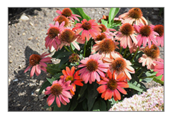
Lakota Fire Coneflower in bloom