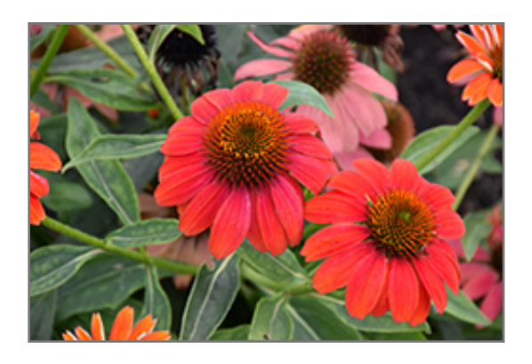
Lakota Fire Coneflower flowers

Lakota Fire Coneflower is an herbaceous perennial with an upright spreading habit of growth. Its medium texture blends into the garden, but can always be balanced by a couple of finer or coarser plants for an effective composition.