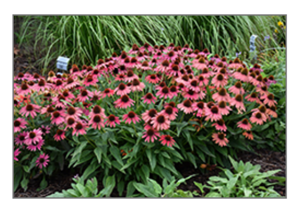
Lakota Fire Coneflower in bloom