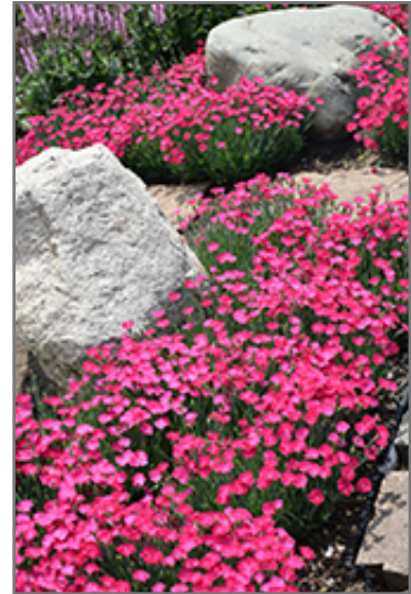
Paint The Town Magenta Pinks in bloom

Paint The Town Magenta Pinks is an herbaceous evergreen perennial with a mounded form. It brings an extremely fine and delicate texture to the garden composition and should be used to full effect.