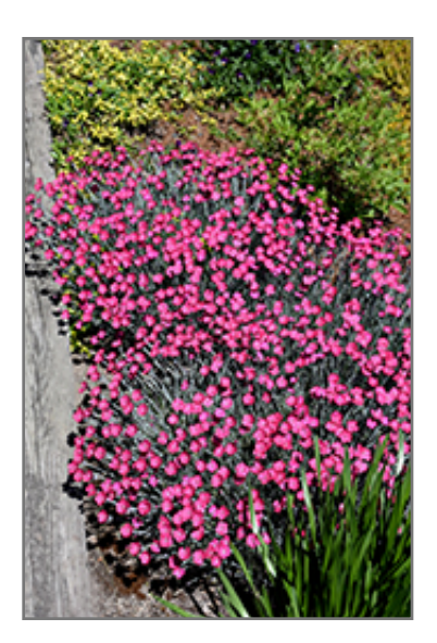
Wicked Witch Pinks in bloom