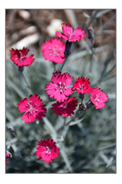
Wicked Witch Pinks flowers

Wicked Witch Pinks is recommended for the following landscape applications;