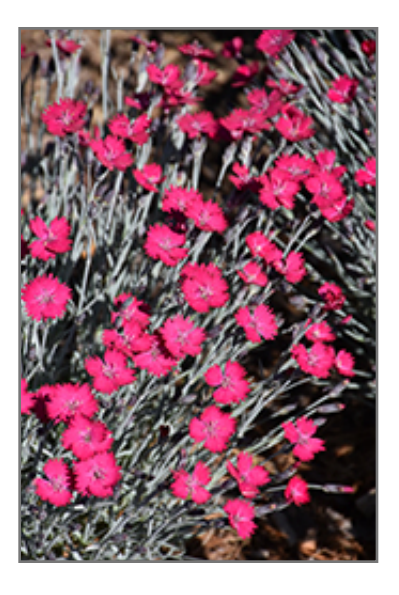
Wicked Witch Pinks flowers

This plant should only be grown in full sunlight. It prefers to grow in average to moist conditions, and shouldn't be allowed to dry out. It is not particular as to soil type or pH. It is highly tolerant of urban pollution and will even thrive in inner city environments. This is a selected variety of a species not originally from North America. It can be propagated by cuttings; however, as a cultivated variety, be aware that it may be subject to certain restrictions or prohibitions on propagation.