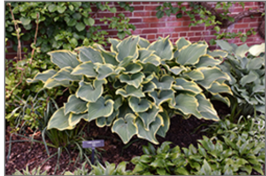
Sagae Hosta