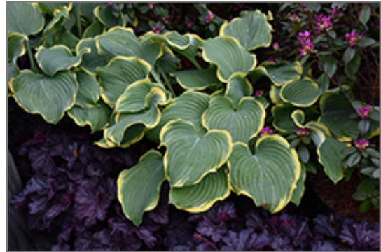
Sagae Hosta

Sagae Hosta will grow to be about 32 inches tall at maturity extending to 4 feet tall with the flowers, with a spread of 5 feet. When grown in masses or used as a bedding plant, individual plants should be spaced approximately 4 feet apart. Its foliage tends to remain dense right to the ground, not requiring facer plants in front. It grows at a medium rate, and under ideal conditions can be expected to live for approximately 10 years. As an herbaceous perennial, this plant will usually die back to the crown each winter, and will regrow from the base each spring. Be careful not to disturb the crown in late winter when it may not be readily seen!