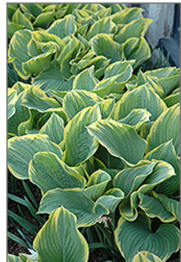
Sagae Hosta foliage