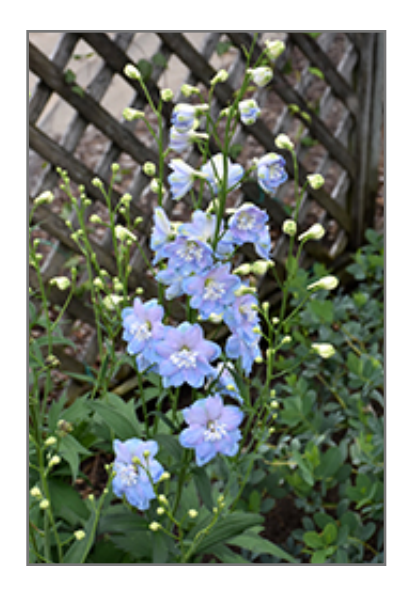
Million Dollar Sky Larkspur flowers