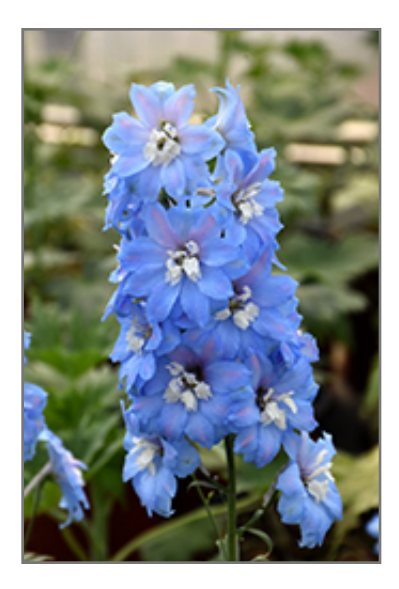
Million Dollar Sky Larkspur flowers

Million Dollar Sky Larkspur is recommended for the following landscape applications;