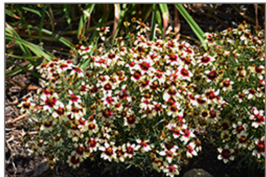
Sizzle And Spice Red Hot Vanilla Tickseed in bloom