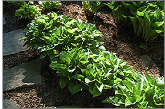
Rim Rock Hosta