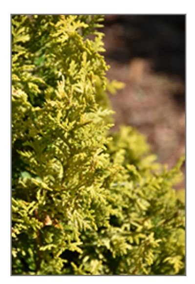
Soft Serve Gold Falsecypress foliage