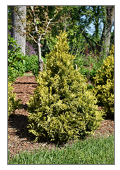
Soft Serve Gold Falsecypress

Soft Serve Gold Falsecypress is recommended for the following landscape applications;