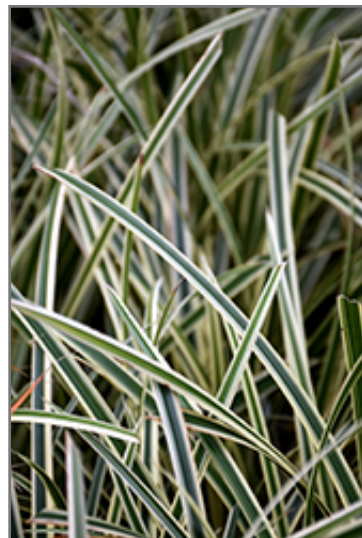
Ice Ballet Sedge foliage