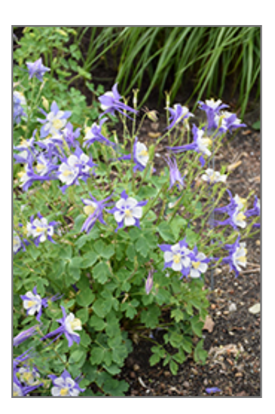
Songbird Blue Jay Columbine in bloom