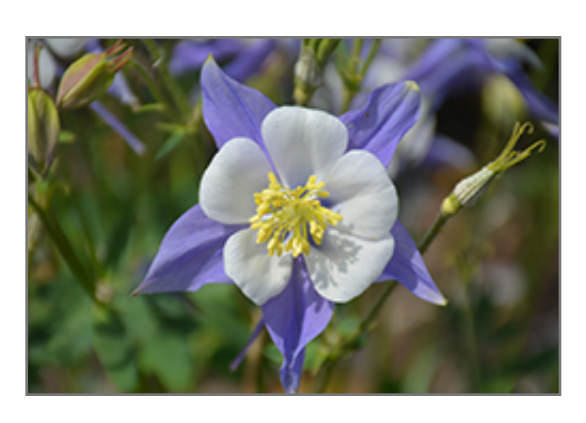
Songbird Blue Jay Columbine flowers