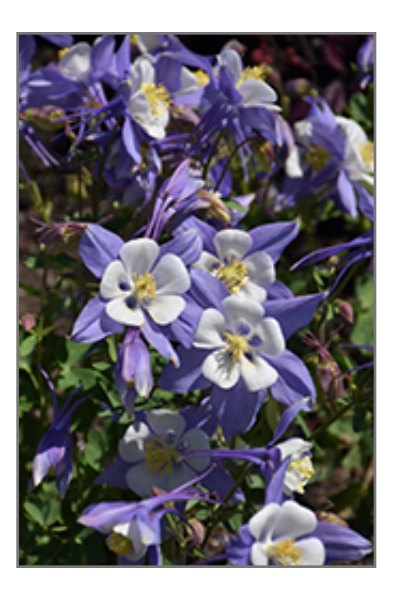
Songbird Blue Jay Columbine flowers

Songbird Blue Jay Columbine is an herbaceous perennial with an upright spreading habit of growth. Its medium texture blends into the garden, but can always be balanced by a couple of finer or coarser plants for an effective composition.