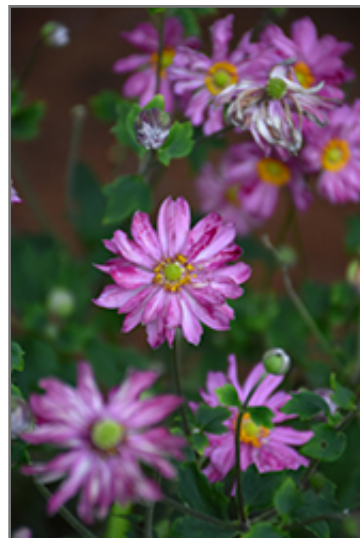
Fall In Love Sweetly Anemone flowers

Fall In Love Sweetly Anemone is recommended for the following landscape applications;