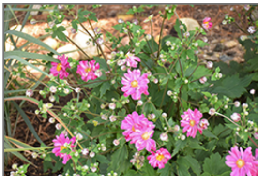
Fall In Love Sweetly Anemone in bloom