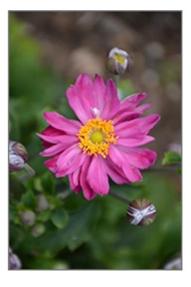
Curtain Call Pink Anemone flowers

Curtain Call Pink Anemone is recommended for the following landscape applications;