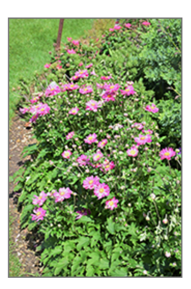
Curtain Call Pink Anemone in bloom